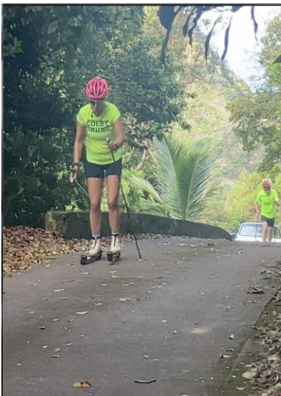
The Troy Hill summit

Saba offers scuba diving, snorkeling, swimming, and a vibrant arts community as well as a network of trails from sea level to a rare elfin rainforest and the highest point in the Kingdom of the Netherlands. See all the island has to offer at Saba Tourism's website .