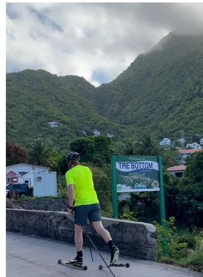
Skiing up to the Bottom